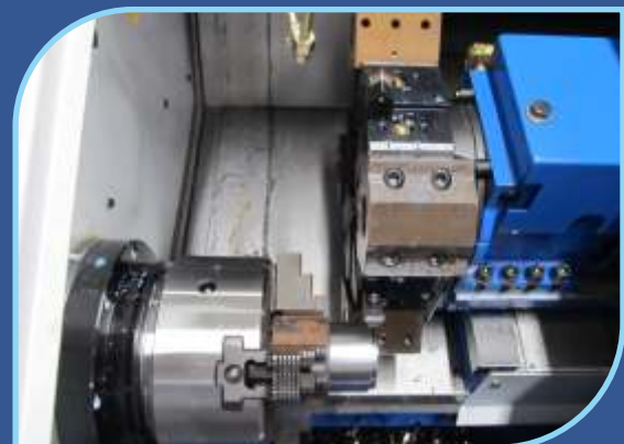
Full Power and Chatter