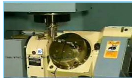
5 - AXES MACHINING CENTER