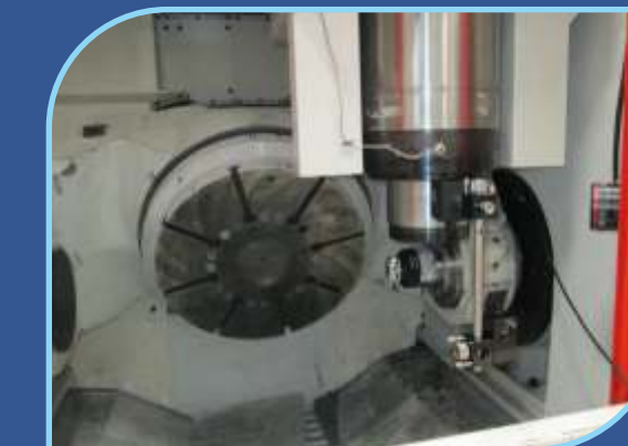
Indexing Accuracy-turn & Tilt Table