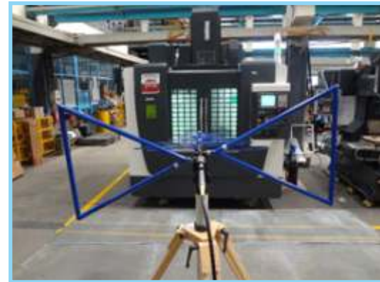
EMI/EMC FOR "CE CERTIFICATION"