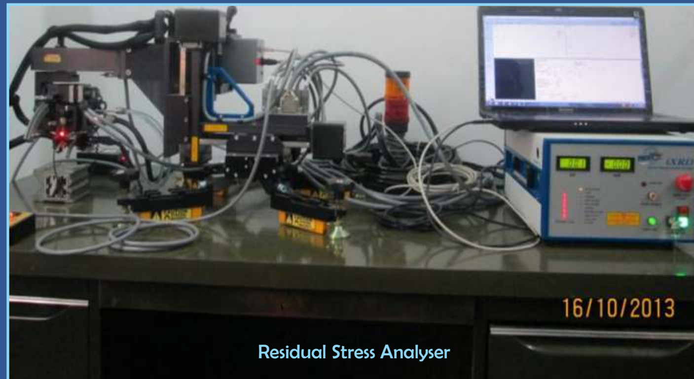
Residual Stress Analyser