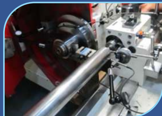
Static Compliance of CNC Machine